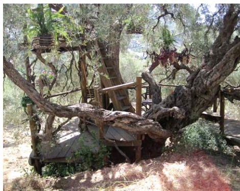
The Tree House in the olive grove

4th – 11th Jan * 15th – 22nd Feb 8th – 15th March 5th – 12th April 19 th – 26 th April (extra) 3rd – 10th May 10th – 17th May (FULL) 31st May-7th June Most dates offer a choice of two walks each day see Walking / Join a Guided holiday on the web site www.hotelfinca.com